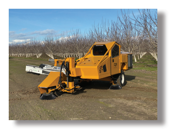
AXIOM hydraulic lift