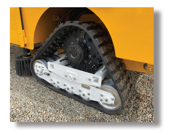
COE TRAX track drive